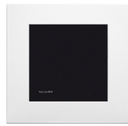
01 pv868 I 26.20

PV868 has also been released on dvd, limited edition of 70 copies by <u>leerraum</u> [] label.