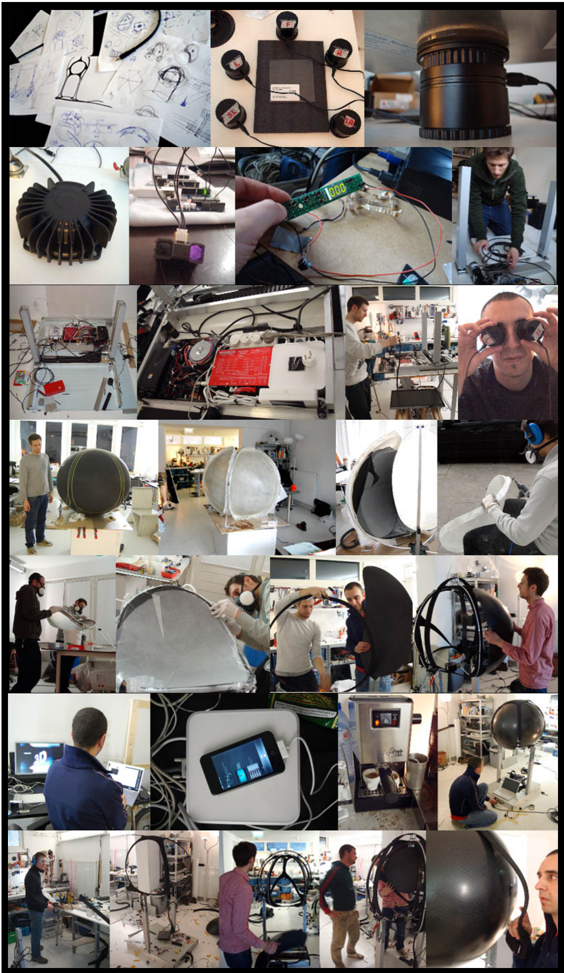
Optofonica Capsule // construction details