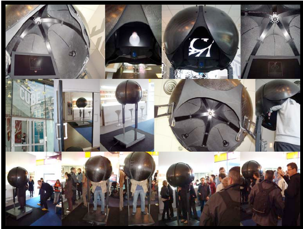
details and premiere at NEMO 2008 (Paris)