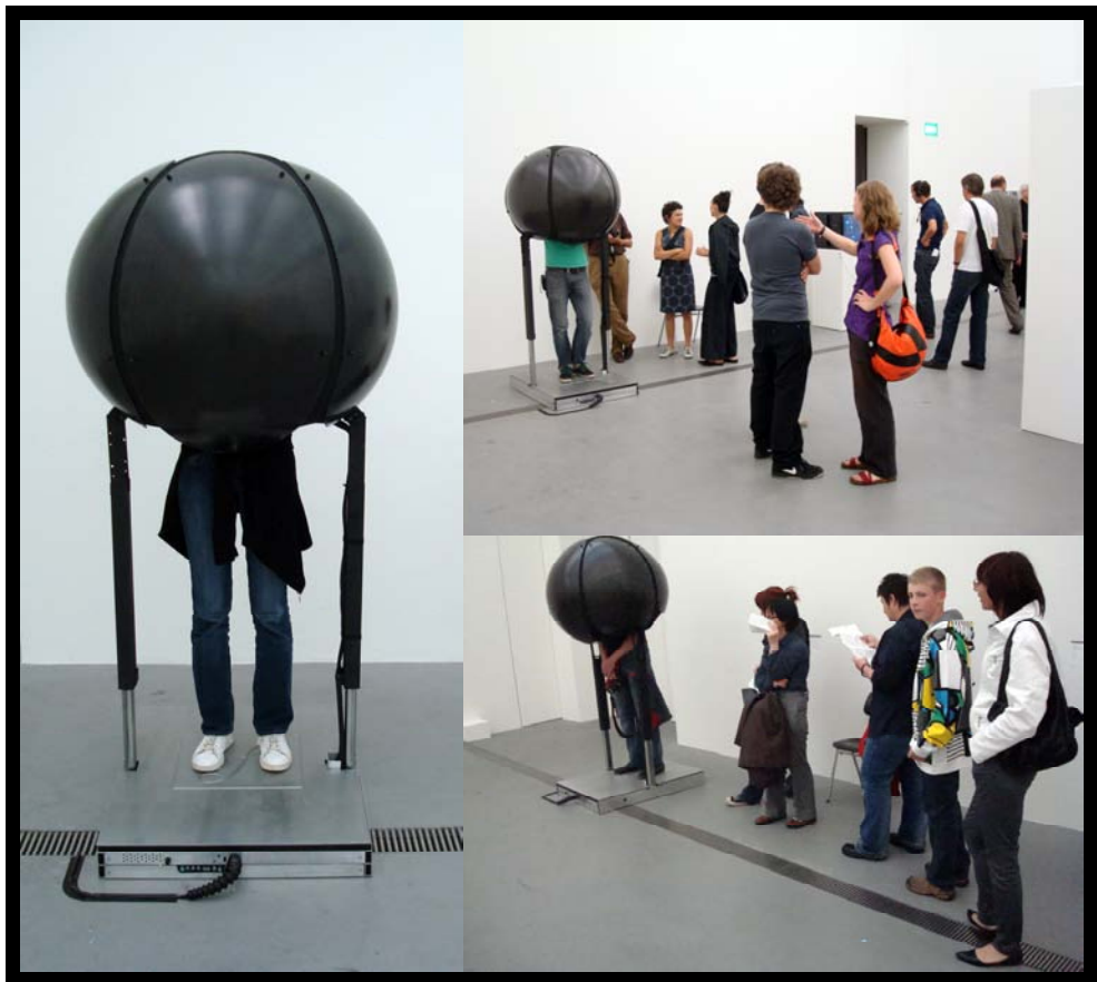
Lentos Kunstmuseum (Linz) / August 2009